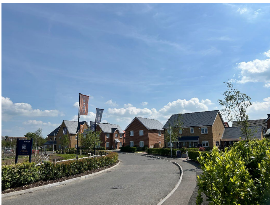
Kingfisher Green Rainham