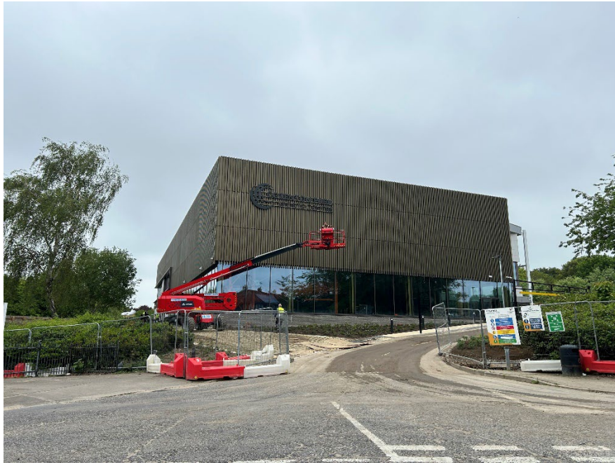
Cozenton Park Sports Centre