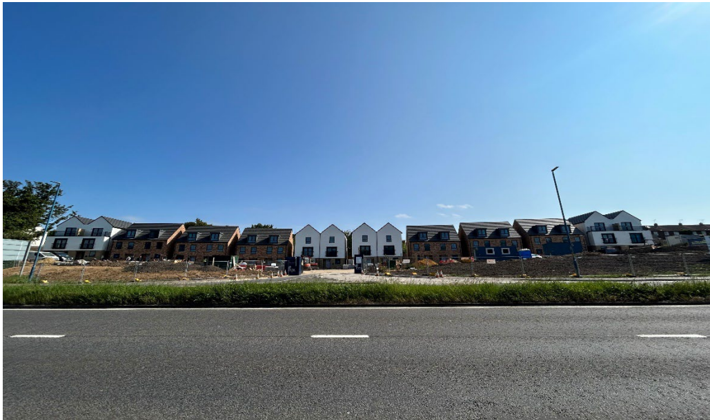
Affordable housing scheme Gillingham