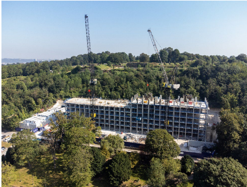
Garrison Point, Chatham