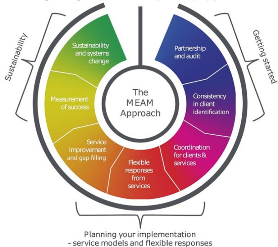
The Making Every Adult Matter (MEAM) approach