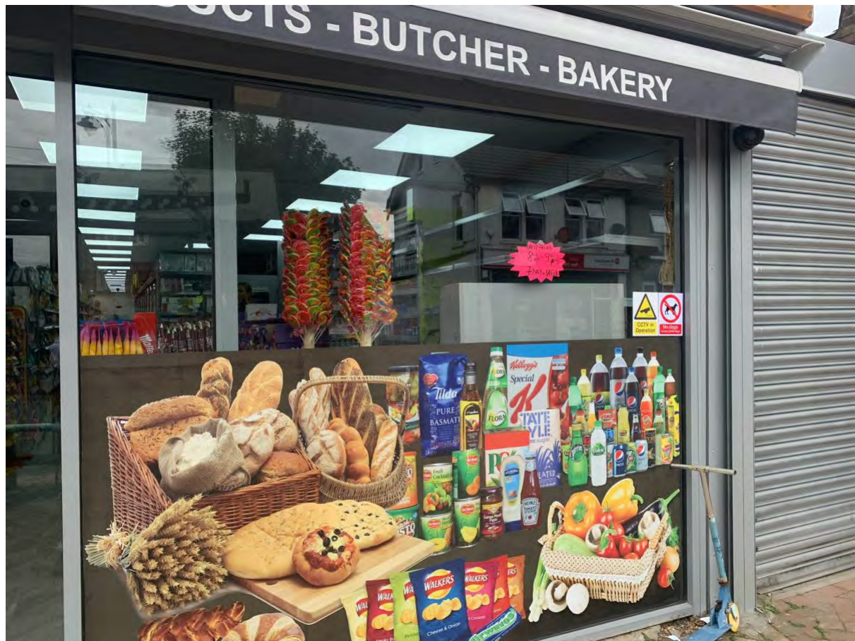
Shop Front 3 – Clear Glass upper