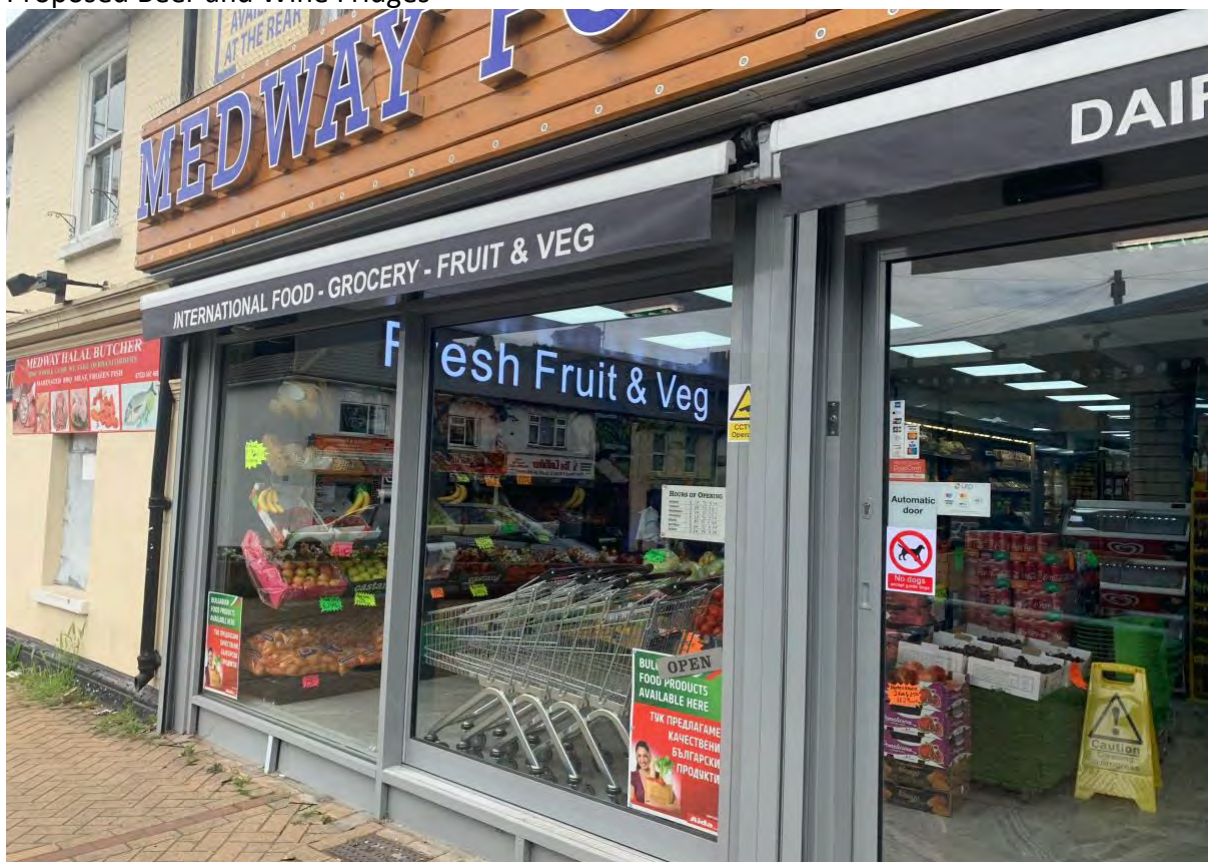
Shop Front 2 – Clear Glass policy