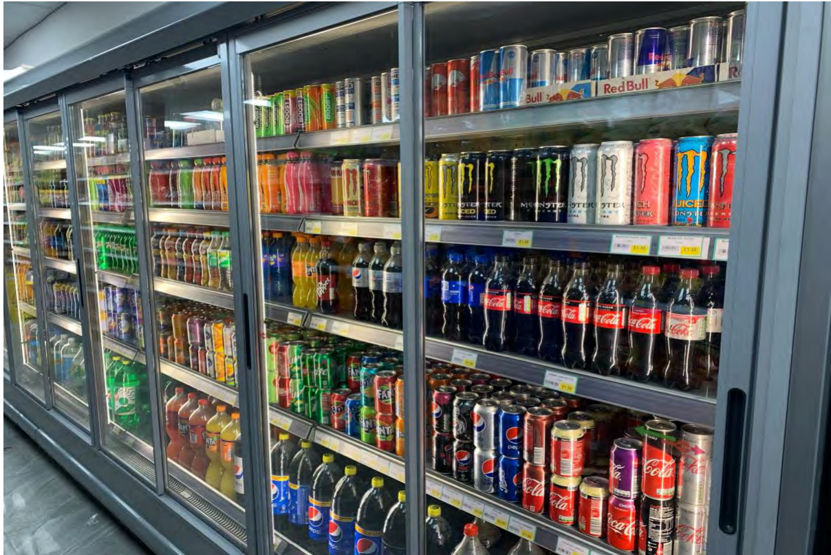
Proposed Beer and Wine Fridges