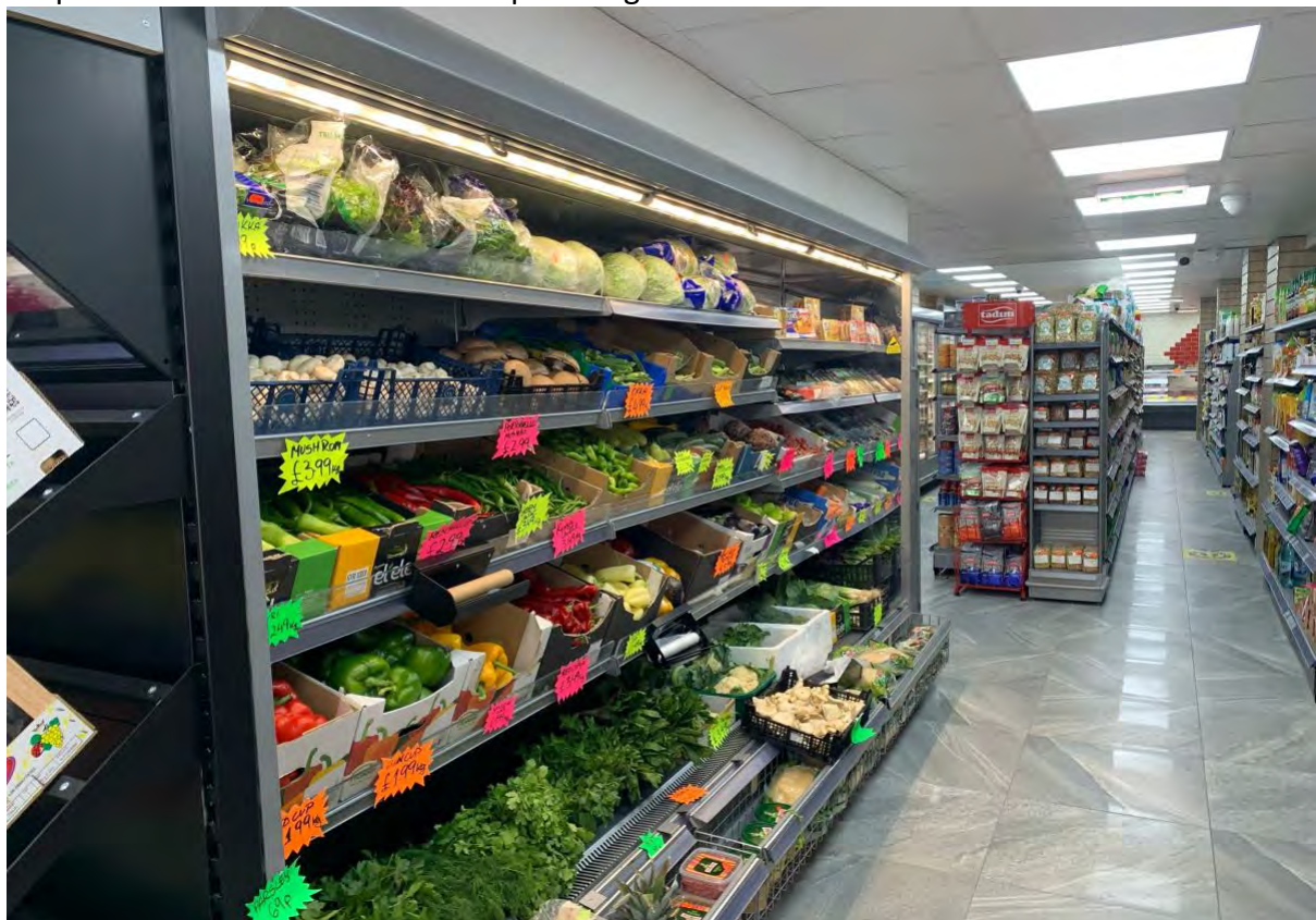
Fresh Veg 1