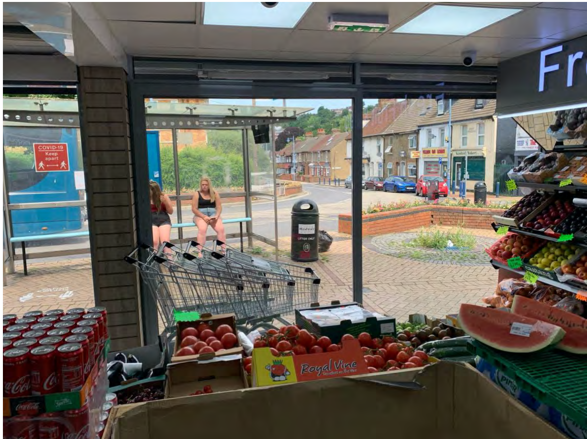
Fresh Veg 2