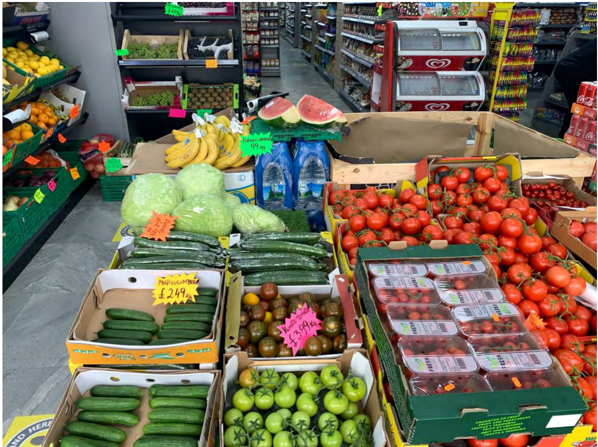
Fruit and Veg 3