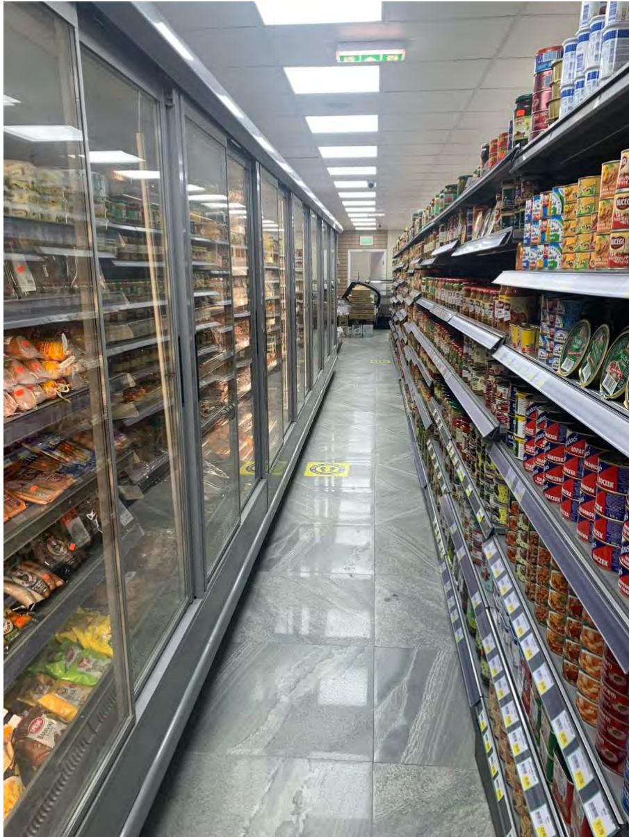
Grocery Retail Aisle 2