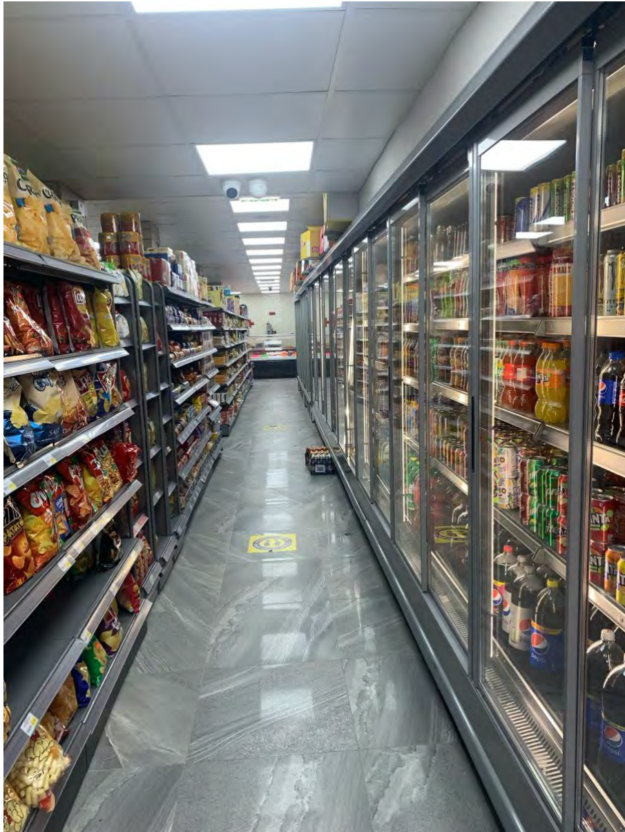
Grocery Retail Aisle