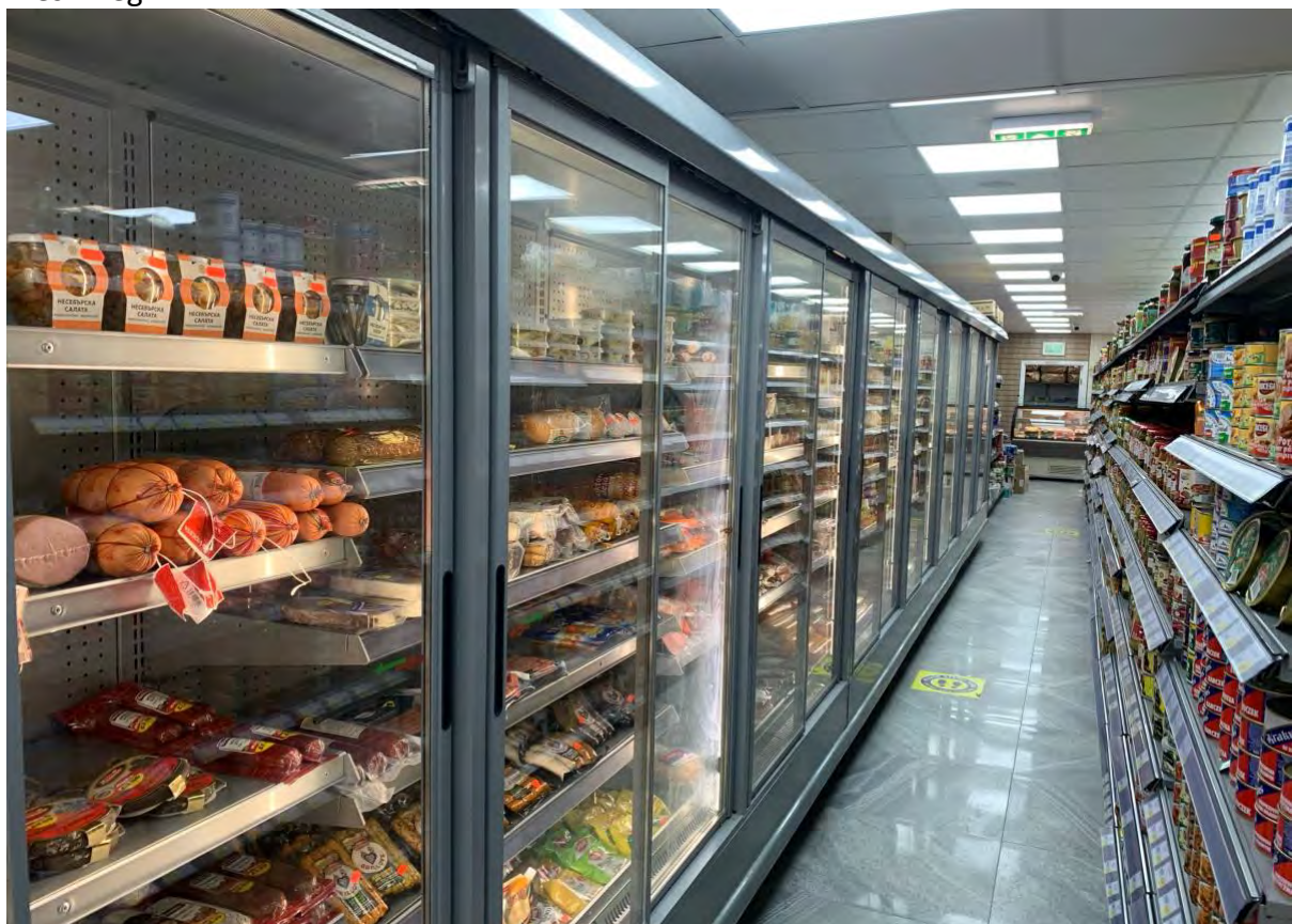
Deli and Fresh Item Fridges