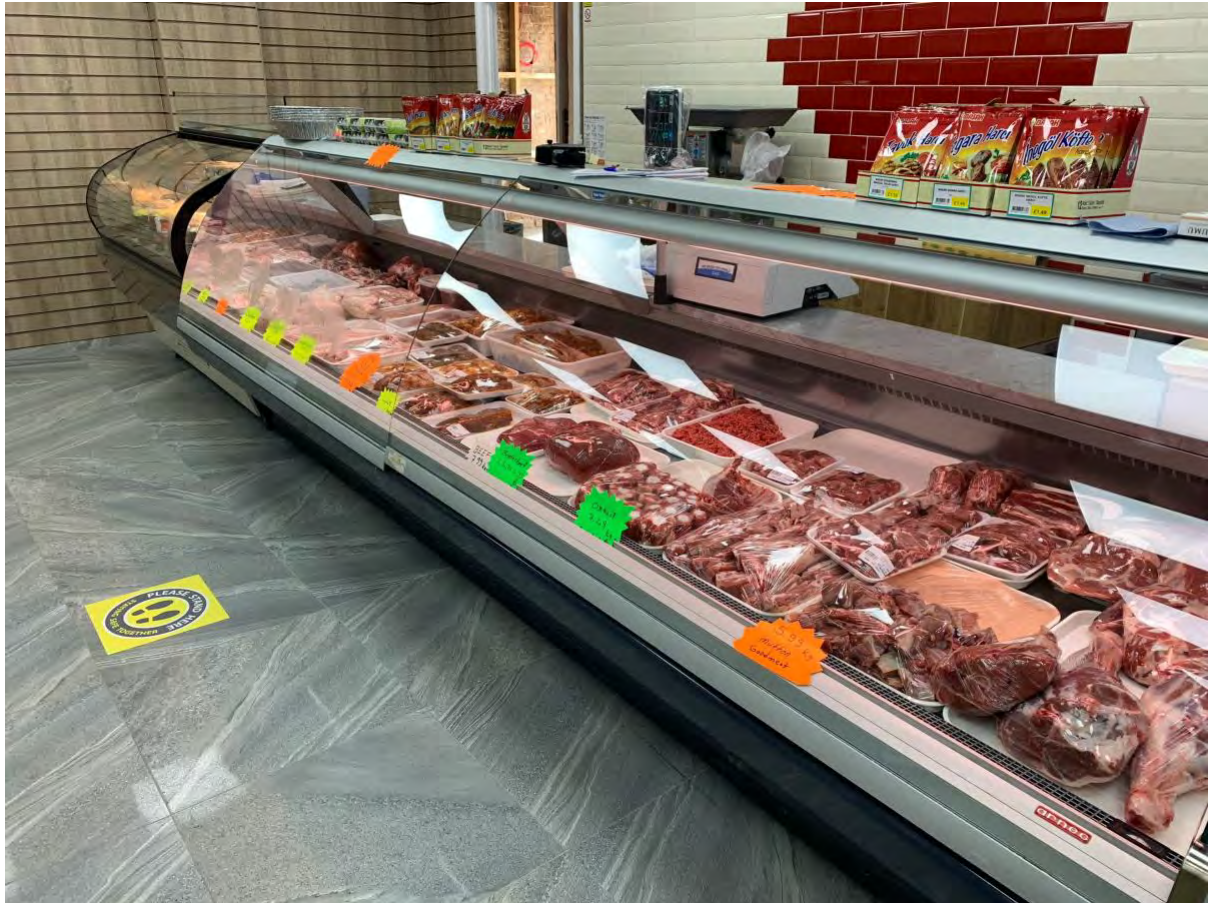
Fresh Meat Deli Counter