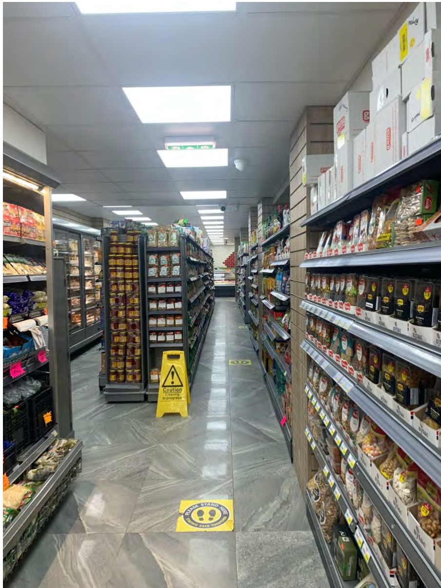
Grocery Retail Aisle 4