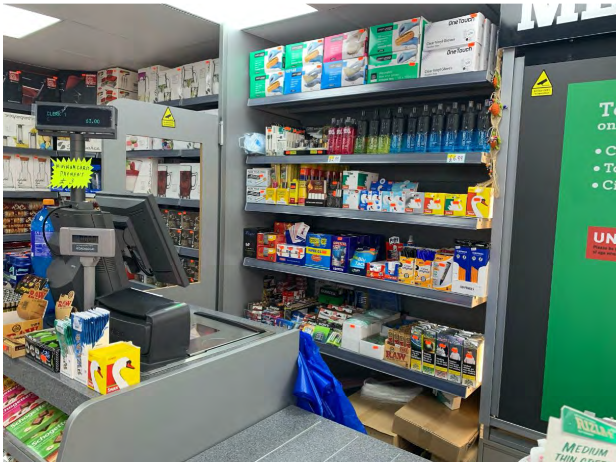
Proposed Area behind counter for spirit range