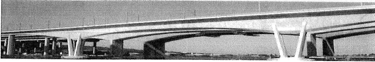
(High-speed rail and M2 motorway bridges over the River Medway at Borstal)

Medway Licensed Taxi Drivers Association