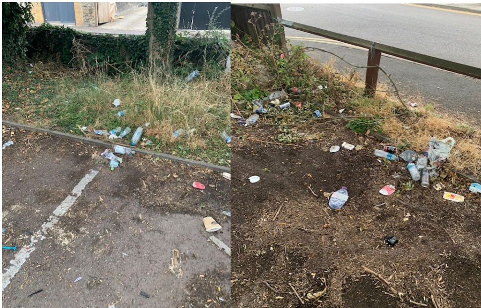
Private Car Park – bottom of Ordnance Street