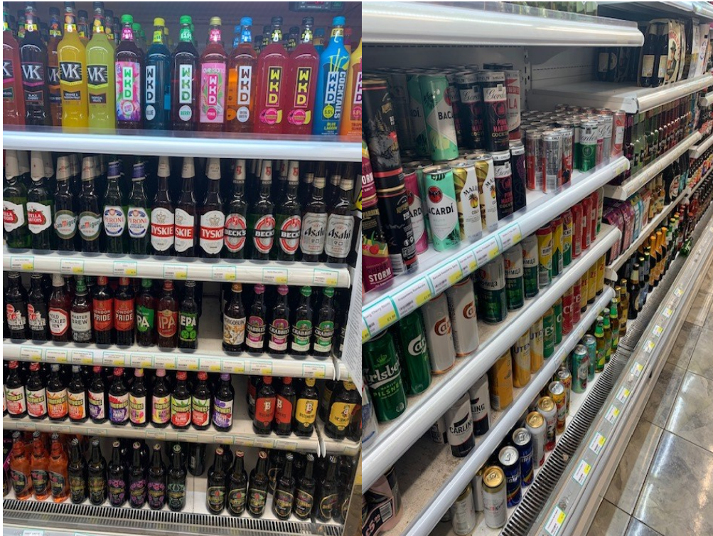
Cans & bottles of beers and ciders sold at Arena Food Centre (none above 5.5% ABV)