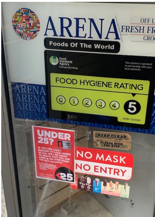
Challenge 25 poster at entrance