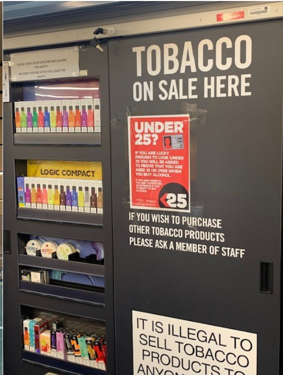
Challenge 25 poster behind counter