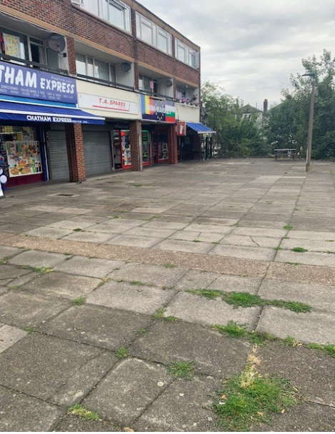
Area in front of Ordnance Street shops