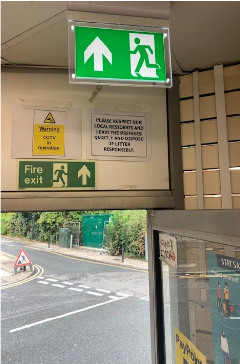
Notice asking patrons to leave quietly