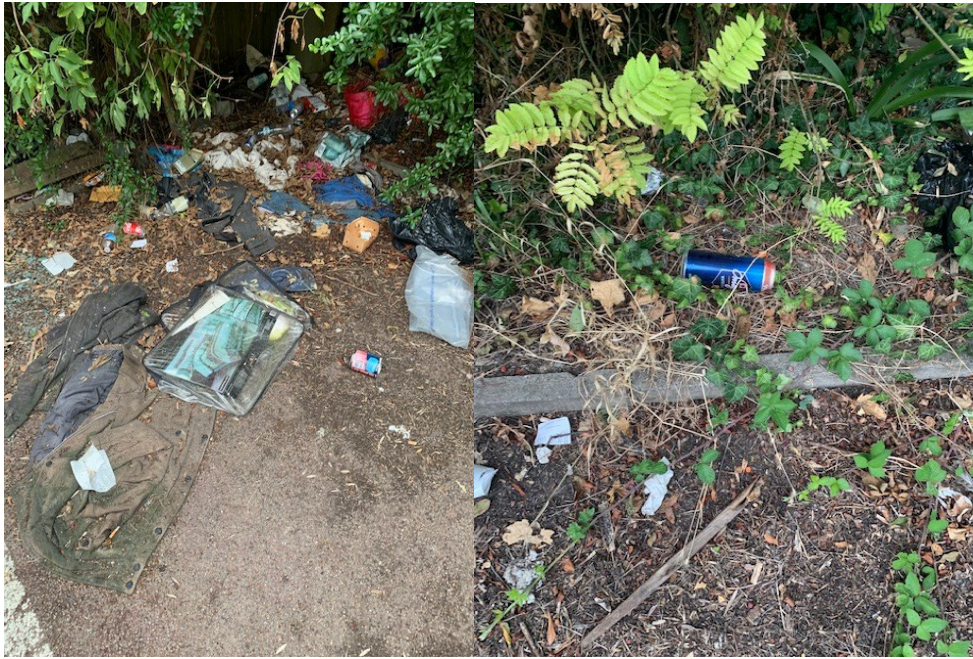
Car Park bottom of Ordnance Street