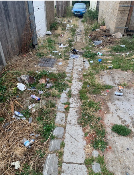
Alleyway between Ordnance St & Rochester St.