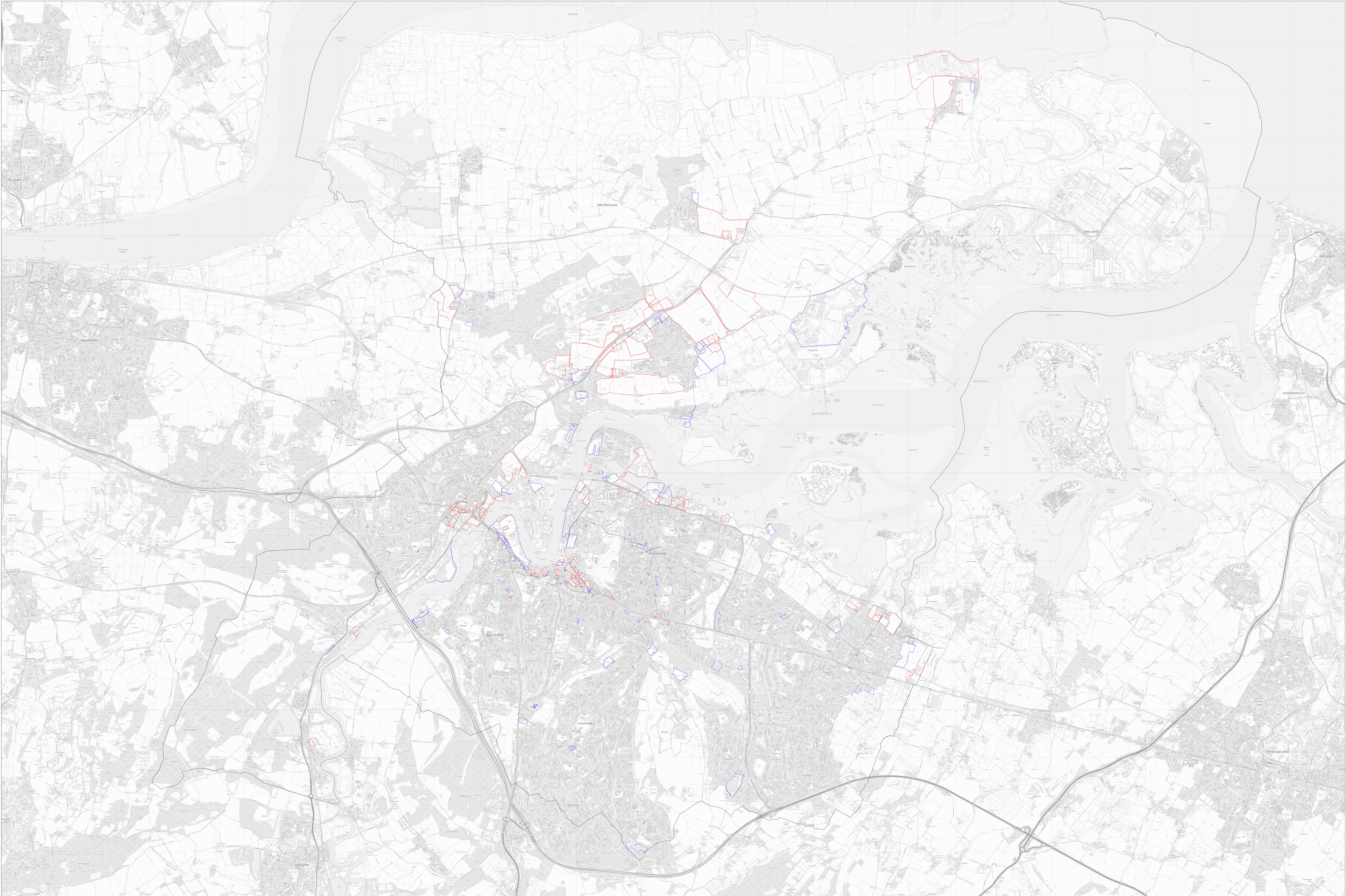
Medway Strategic Land Availability Assessment (SLAA), 2019: Development pipeline sites (residential and commercial land, with planning consent/under construction) IN BLUE OUTLINE